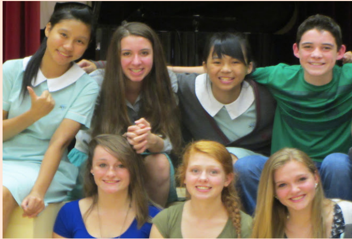
Cabell County Schools students visit with their peers in Hong Kong.